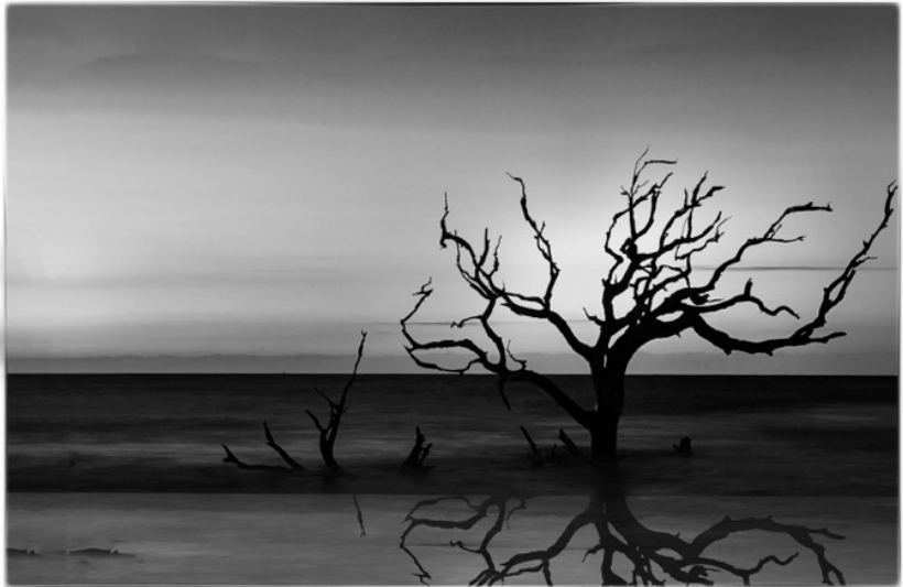
Dan Pacinelli "Pathway" 3 rd Place