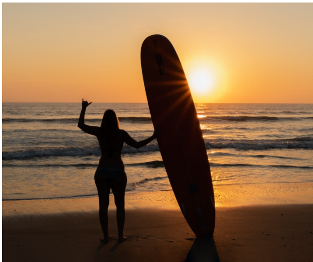
Susan Fox "Aloha -Sunrise and the Sea" 2 nd Place