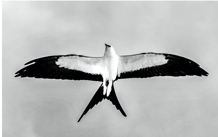
Lee Benson "Shallow Tail Kite" 1 st Place