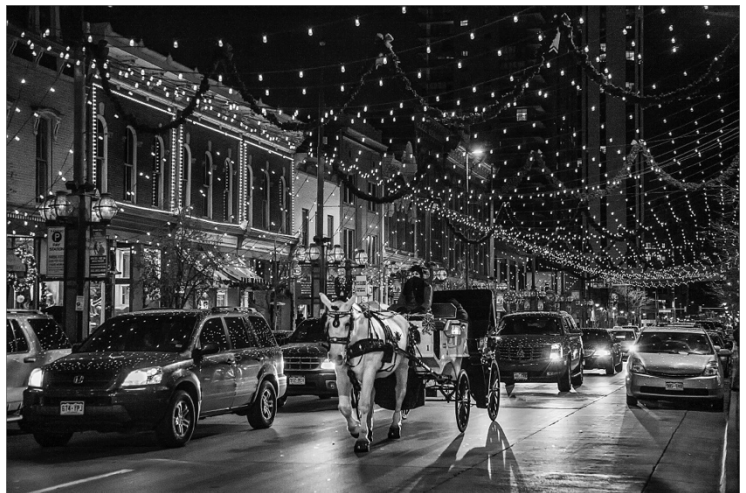
Ben D'Andrea "Holiday Lights" 3 rd Place