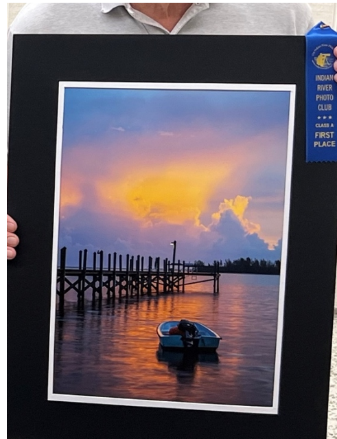
Tom Doyle "Outboard" 1 st Place