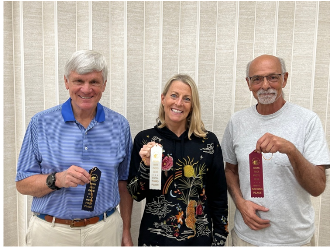
Lou Lower "Moment of Calm" 1 st Place