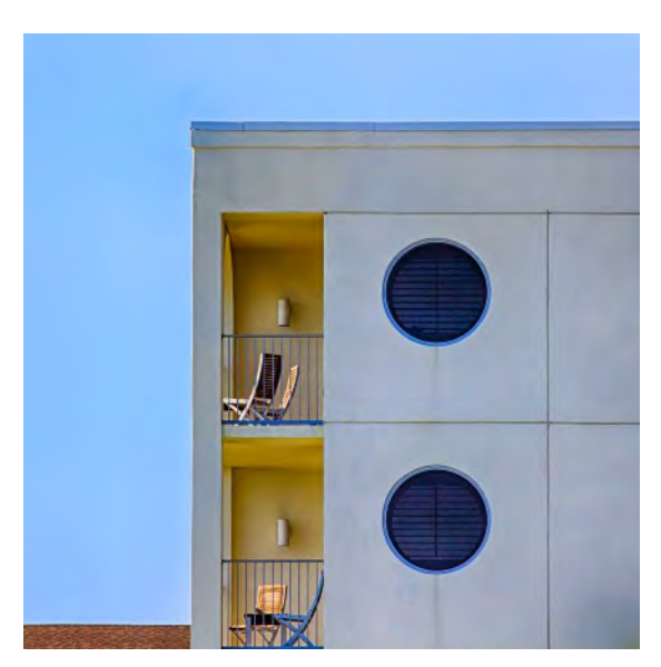
"Round Windows and Deck Chairs" By Lynn Luzzi Juried Inn