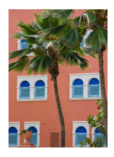
"Villas on The Beach" By Lynn Luzzi Juried In