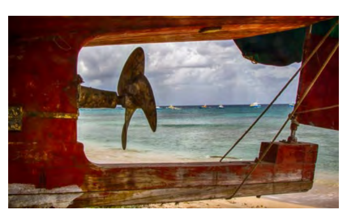
"A Proper View" By Lynn Luzzi