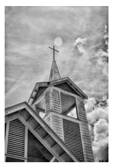
"The Steeple" By Lynn Luzzi Honorable Mention