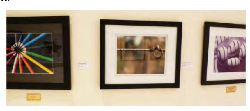
Part of The Museum Gallery

If not, there is still time to do so and just incase, we are adding the rules etc at the end of this newsletter, so you may know what is required and how and when to enter.