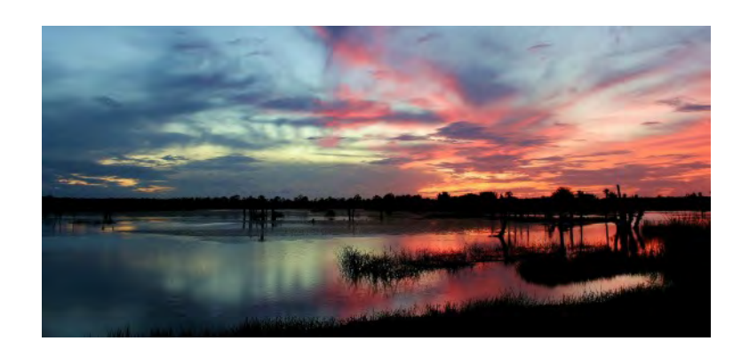
"The Beginning of a Beautiful Night" By Liesl Walsh Honorable Mention