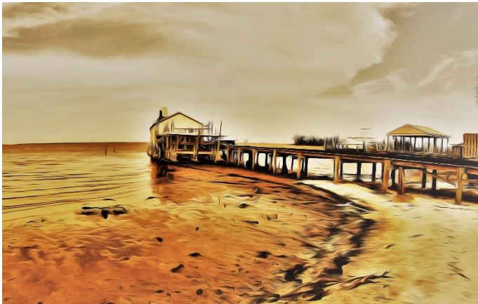
Billy Ocker "Withstanding Time" 2 nd Place