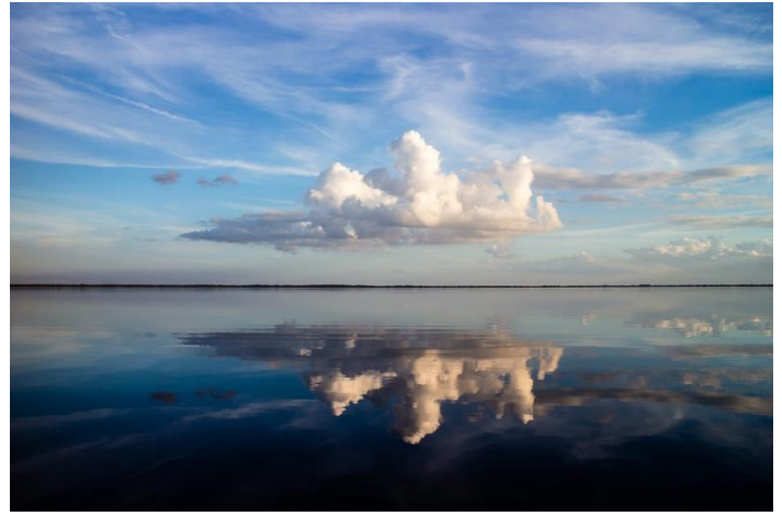
Patty Corapi "Land Between" 1 st Place