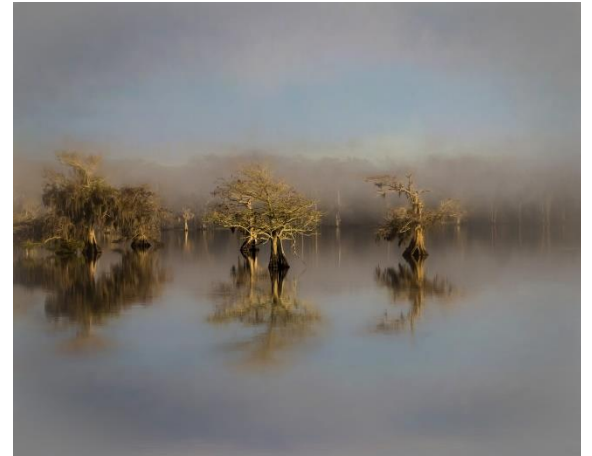
Susan Grube "Blue Cypress Smudge" 1 st Place