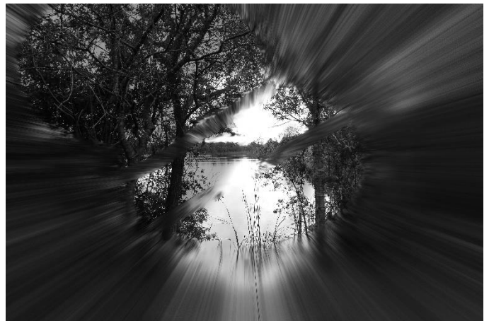
Bobbi Whitlam "Racing Forwards" 3 rd Place