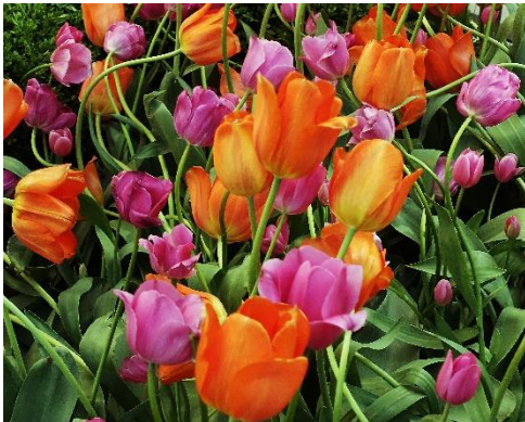
Rene Donars “Wind Blow Tulip Patch” 2 nd Place B Class