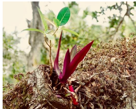
Jerry Merrit “Symbiosis” 3 rd Place B Class