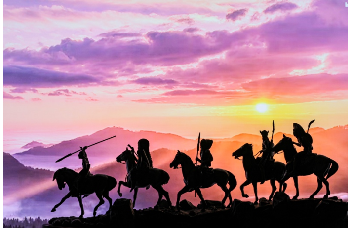
Billy Ocker "Morning Hunt" 1 st Place