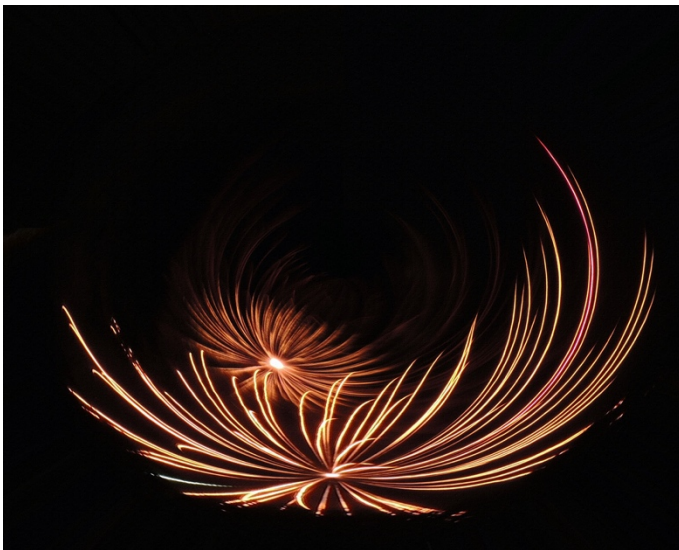
Arlene Willnow "Fire Works" 2 nd Place