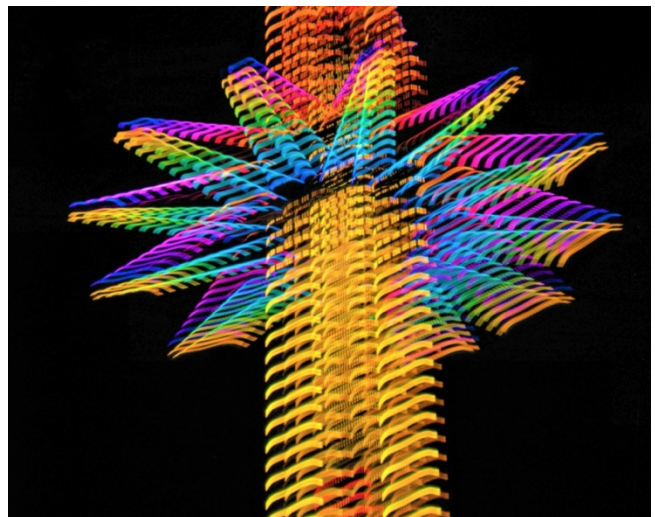
Kathie Phillips "Light Painting Colors" 3 rd Place