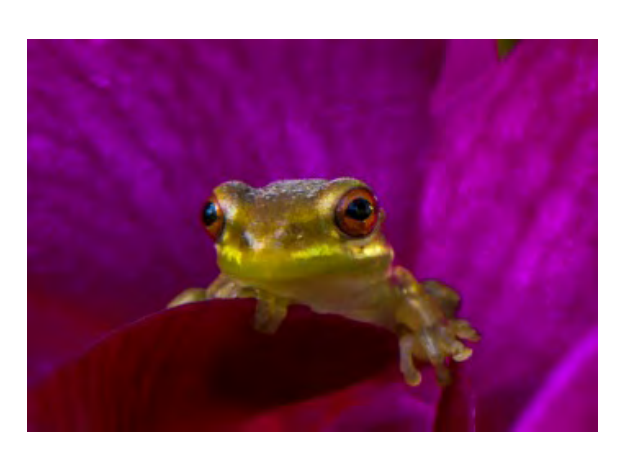
"A Tree Frog on an Orchid" By Lee Benson Class B Color Open Second Place