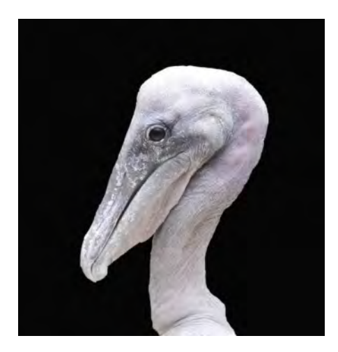
"The Bald & The Beautiful" By Stephanie Black Class B Special Techniques Second Place