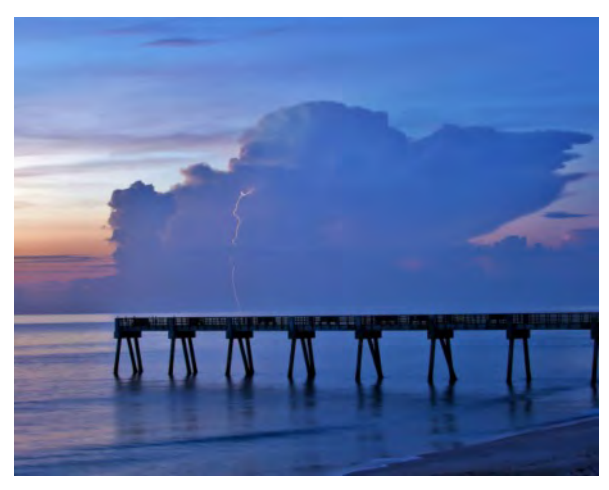
"First Caption of The Day" By Billy Ocker Class A Color Second Place