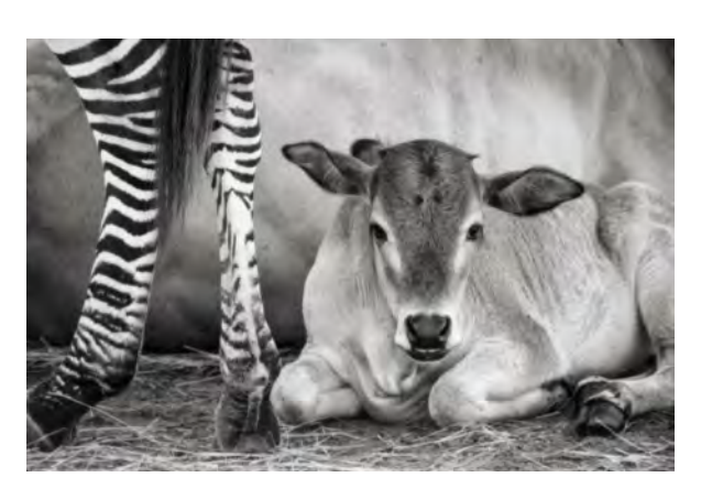
"The New Face" By Lynn Luzzi Class B Monochrome Second Place