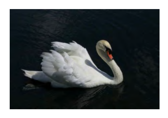
"Swanning Around" By Hazel Lacks Class B Monochrome Honorable mention

Photographs on the right By Shelly Stang