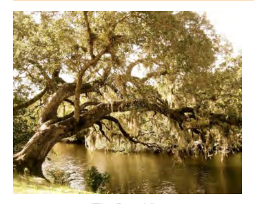
"The Reach" By Leisl Walsh Class A Color, Third Place Open