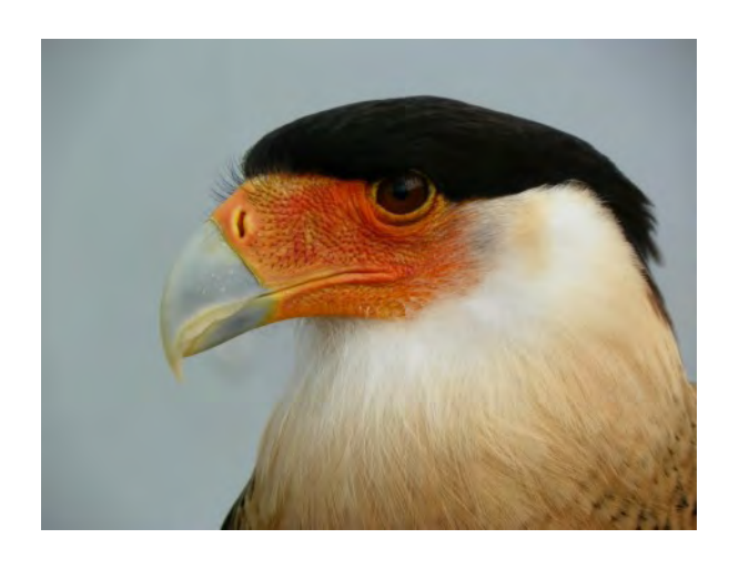
"Cara Cara" By Shelley Stang Class A Open, Color First Place