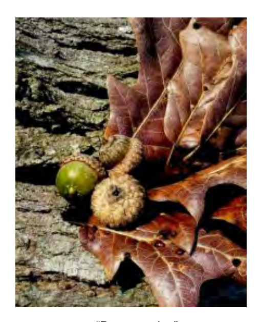
"Regeneration" By Donna Green Class A Color, Honorable Mention