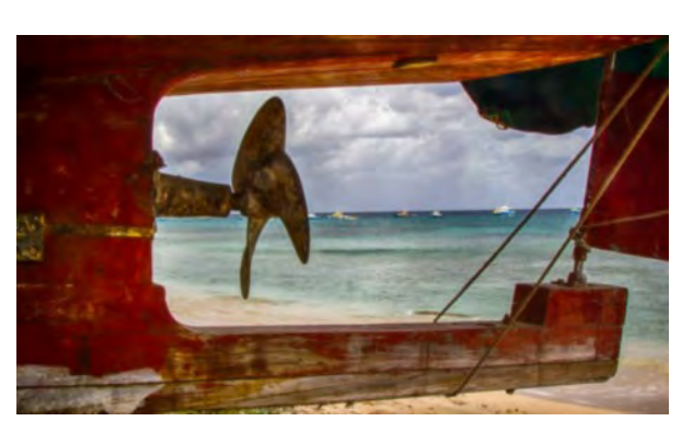
"A Proper View" By Lynn Luzzi Class B Color, First Place