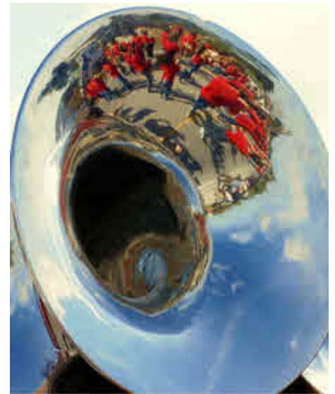
Right “Marching in Circles” By Roger Sobkowiak