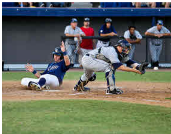
Above