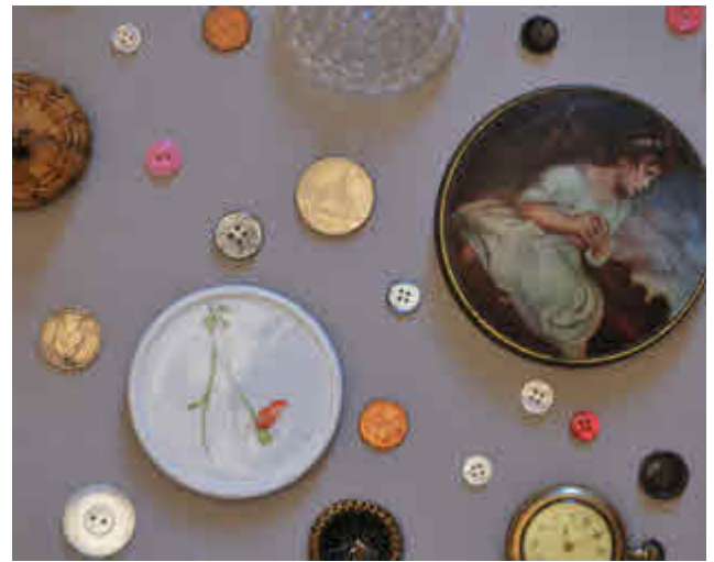
"Circles" By Miriam Barton

Class B Color, Honorable Mention Taken with a Nikon D60 using natural lighting. 1/4 second at F 7.1, ISO 800