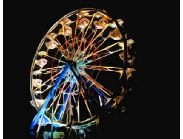
"The Wheel" By Earl Evans Class A Special Techniques, Second Place

Main photo taken using a Nikon D80, F 3.6 at 1sec ISO 100, developed in CS3 Windows