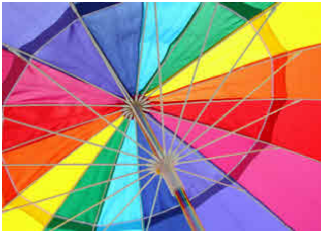
Left "Best of Summer" By Theresa Reynolds Class B Color, Third Place

Main photo taken using a Nikon D80, F 3.6 at 1sec ISO 100, developed in CS3 Windows