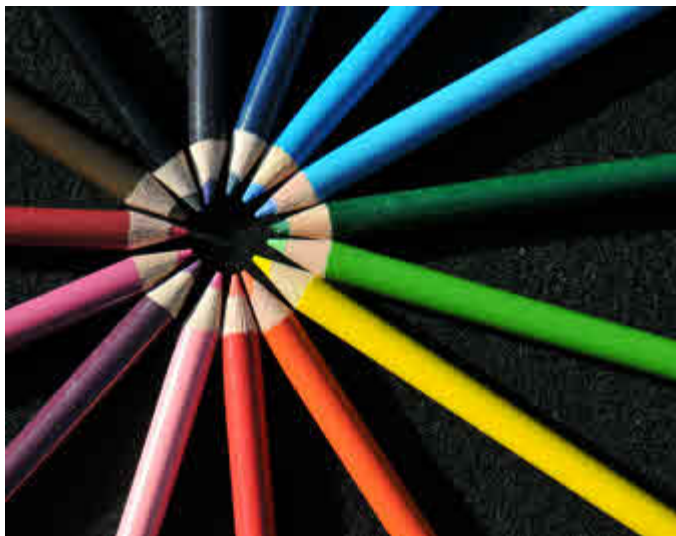
Below “Focal Pointers” By George Bollis, Class A Color Second Place Nikon D300, F3.2 at 1/320th sec. ISO 200