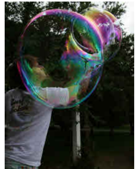
“Bubbles Blowing Brother” By Sarah Kapel Class B, Color, First Place Canon EOS7D, 1/400th at F4.5, ISO 100