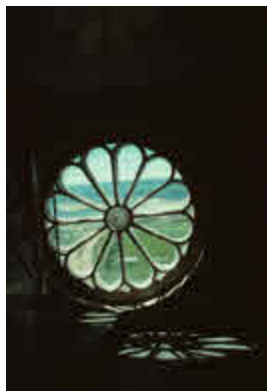
Is this inside or outside? Both the window and the skate tip.