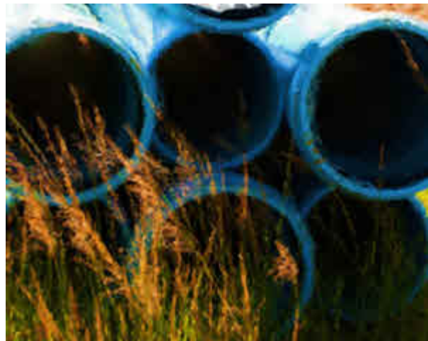
"Field of Pipe Dreams" By W.R. Woodard, Class B, Special Techniques Third Place Developed using CS5