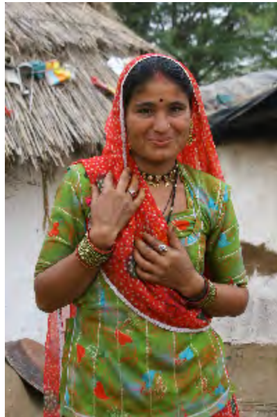
"Bishnoy Woman" in traditional clothing and jewelry.

She owns a full-frame 12.8-megapixel Canon 5D yet her go-to camera remains her trusty Canon 20D, equipped with a variety of zoom lenses up to 400 mm. In fact, on distant trips when she has to carry