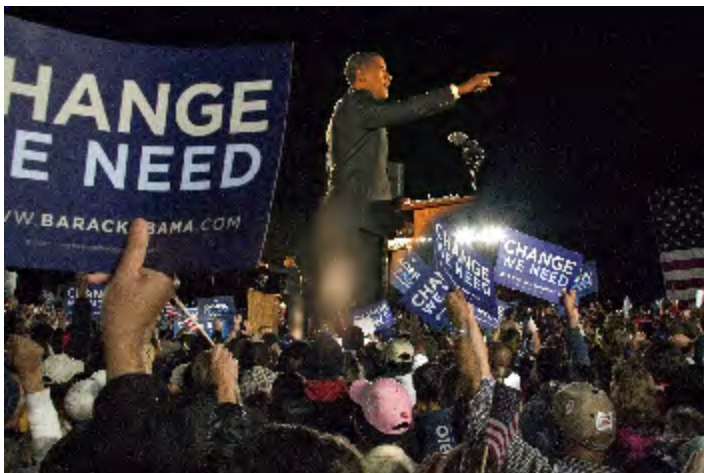
"Yes We Can" By Bob Strupat Class A, Digitally Altered Second Place