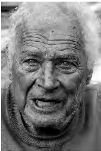
"Untitled" By Jim Cohoe Class A, Black & White Honorable Mention