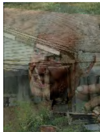
"Untitled" By Jim Cohoe Class A, Digitally Altered, First Place