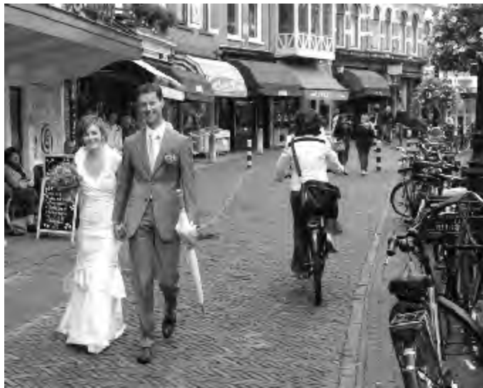
"Newly Wed Smiles" By Roger T. Sobkowiak Class A, Black & White First Place