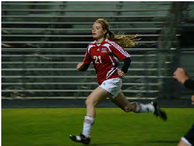
"Speed Demon" By Kelly Ward Class B, Color Third Place