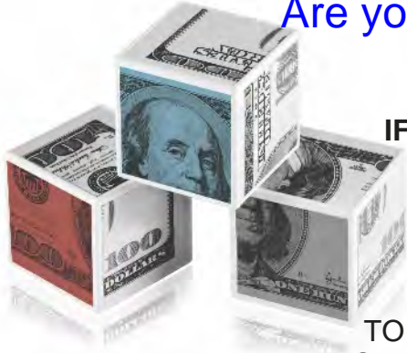
The building blocks of our club's future