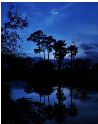
"Blue Lagoon" By George Bollis Class A Special Techniques First Place