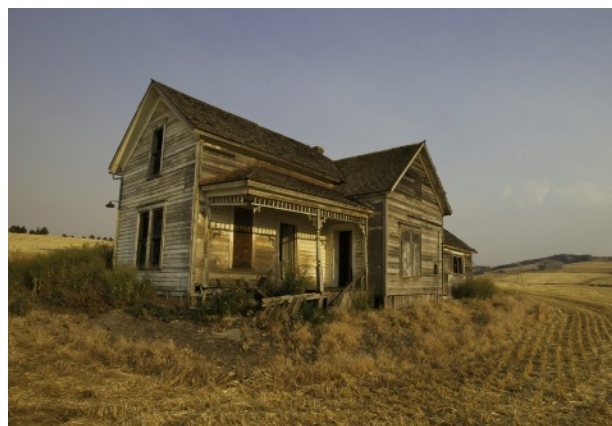
"Prime Real Estate" By Barbara du Pont Class A Color First Place