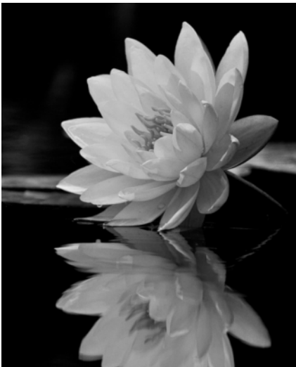
"Elegance" By Patty Corapi Class A Monochrome Honorable Mention