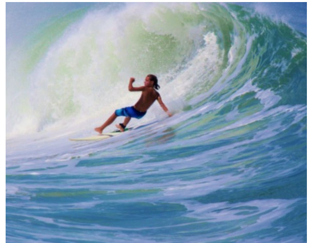
"Riding The Big Wave" By Liesl Walsh Class A Color Third place