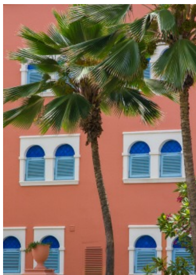
"Villas on The Beach" By Lynn Class B Color First Place

Comments: Holetown, Barbados. A breezy day. Handheld at 1/125th sec, f 9, 105mm, ISO 400. Using Canon 24-105mm lens on Canon T2i.