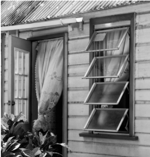
"Fresh Air" By Lynn Luzzi Class B Monochrome Second Place

A chattel house in Speightstown, Barbados. Handheld at 1/13th sec, f 14, 47mm, ISO 100. Using Canon 24-105mm lens on Canon T2i.