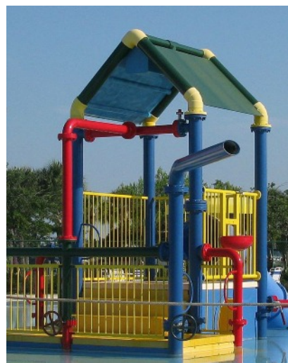
"Pool Toy" By Mia Arrington Class B Color Second Place